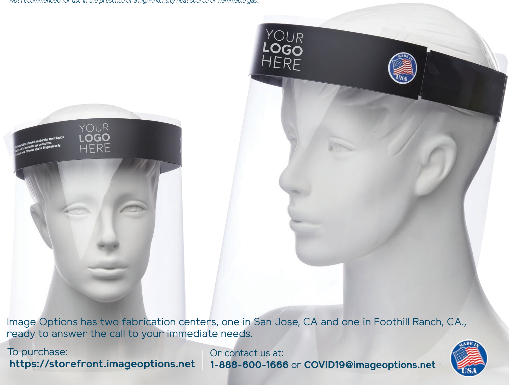
Image Options has two fabrication centers, one in San Jose, CA and one in Foothill Ranch, CA., ready to answer the call to your immediate needs.